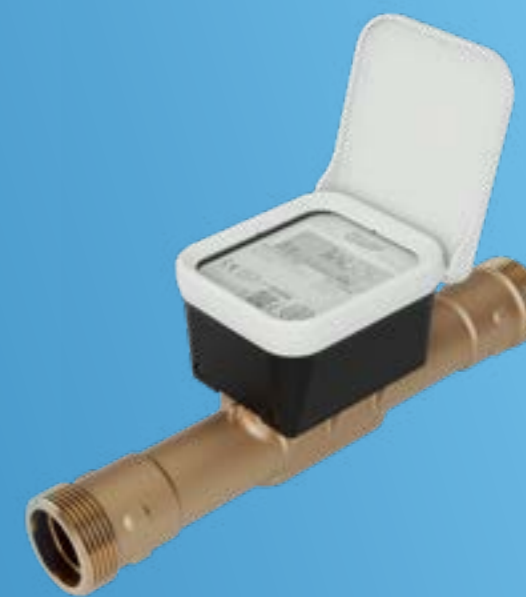
sonico ® NANO DN40