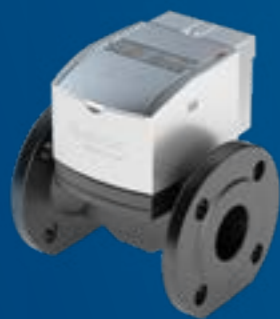
sonico ® EDGE DN50