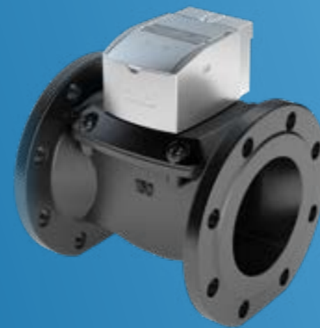
sonico ® EDGE DN150/200