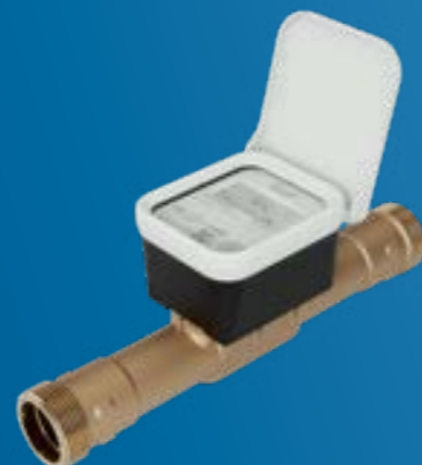
sonico ® NANO DN25