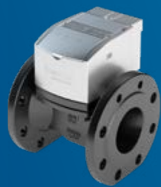
sonico ® EDGE DN80