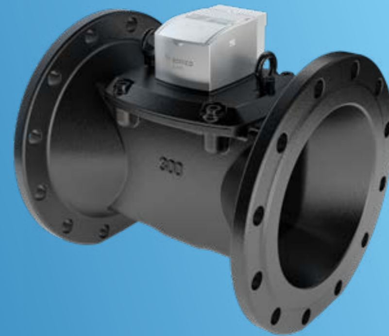
sonico ® EDGE DN250/300