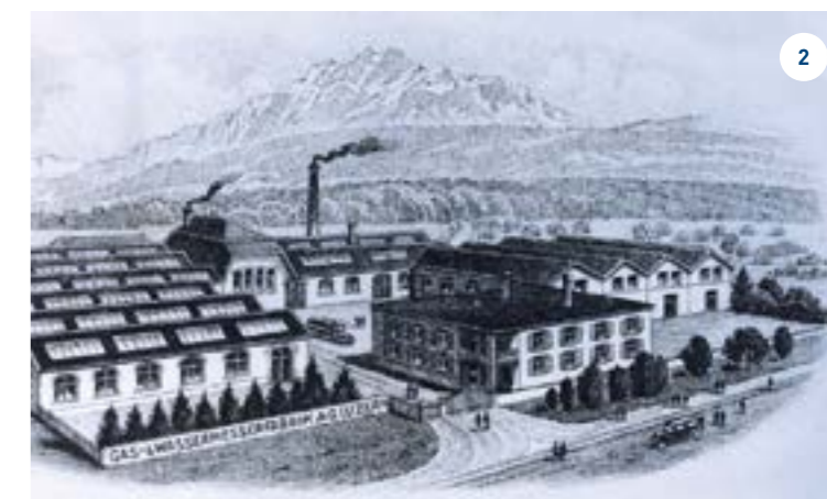
1 Family owned and committed to the future. 2 Founded in 1899 in Lucerne.