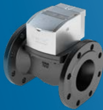
sonico ® EDGE DN100