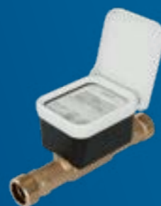
sonico ® NANO DN20