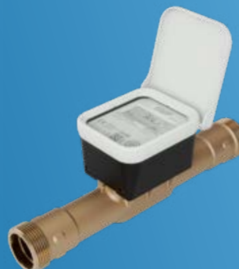
sonico ® NANO DN32