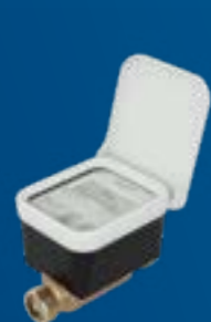
sonico ® NANO DN15